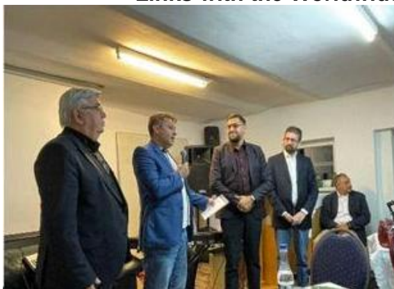
Translated books dedicated in Ghimbav