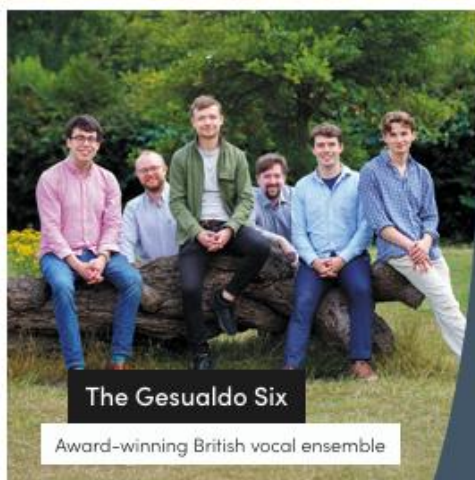
The Gesualdo Six