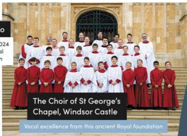
The Choir of St George's Chapel, Windsor Castle

First-prize winner, 2024 Leeds International Piano Competition