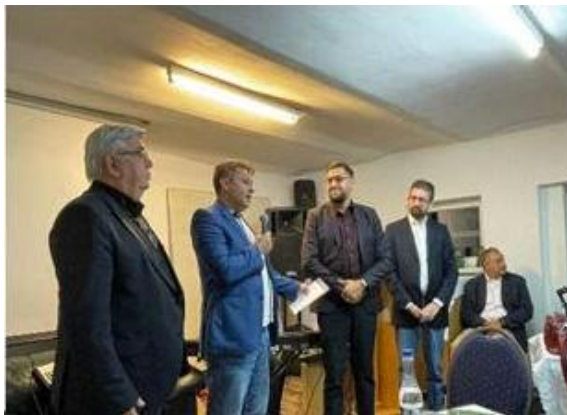
Translated books dedicated in Ghimbav