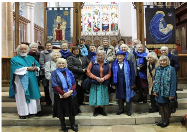
The Mothers Union

A motion was unanimously passed by all present to become diocesan members. Remaining members also agreed and currently we have 18 diocesan members. The branch is now officially closed but we will continue to meet as MU members in faith and friendship.