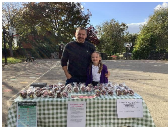
A playground stall

The ambitious campaign was driven by the children's School Council, with some help from the staff, with the aim of raising £6,000 to be used to help upgrade the school's computing infrastructure and equipment.