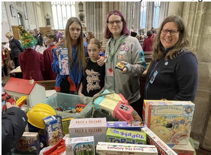
Guides sell toys at the fair

Guides We currently have an enthusiastic and lively group of Guides. The girls have continued to undertake a range of activities as part of the Guide programme. The summer term mostly centred around developing camping skills, although unfortunately we did not have the opportunity to take the girls away and put their skills into practice. Later in the year they completed the ABC challenge badge which involved doing an activity related to every letter of the alphabet. The girls suggested the activities and so we found ourselves making potions (a scientific experiment) and gingerbread houses, going on a winter walk and writing limericks amongst other things. The year culminated in taking part in the Girlguiding Anglia Pyjama Party in February to celebrate Thinking Day when we think about Girlguiding as a worldwide organisation. Locally the girls joined