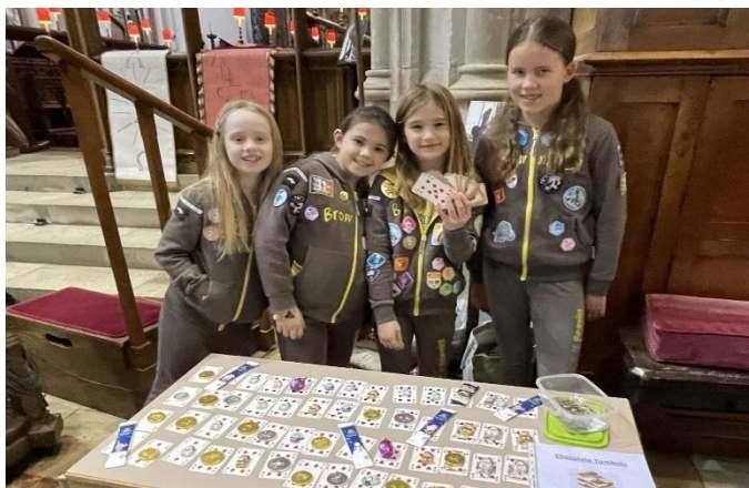
Brownies stall at the Fair

St. Mary's Brownies The Brownies are always busy, with 31 individual interest badges being completed during the year of 2024, with 'Collecting' being the most popular badge this year. We have also been doing a wide range of activities and challenges during meetings, as our Brownies work towards the different awards Bronze, Silver and Gold. The Brownies have designed and created prototypes of inventions, and researched Women inventors as part the Inventing badge. (Coffee makers, ice cream makers, dishwashers and windscreen wipers were all designed by women, amongst many other things!) The Brownies