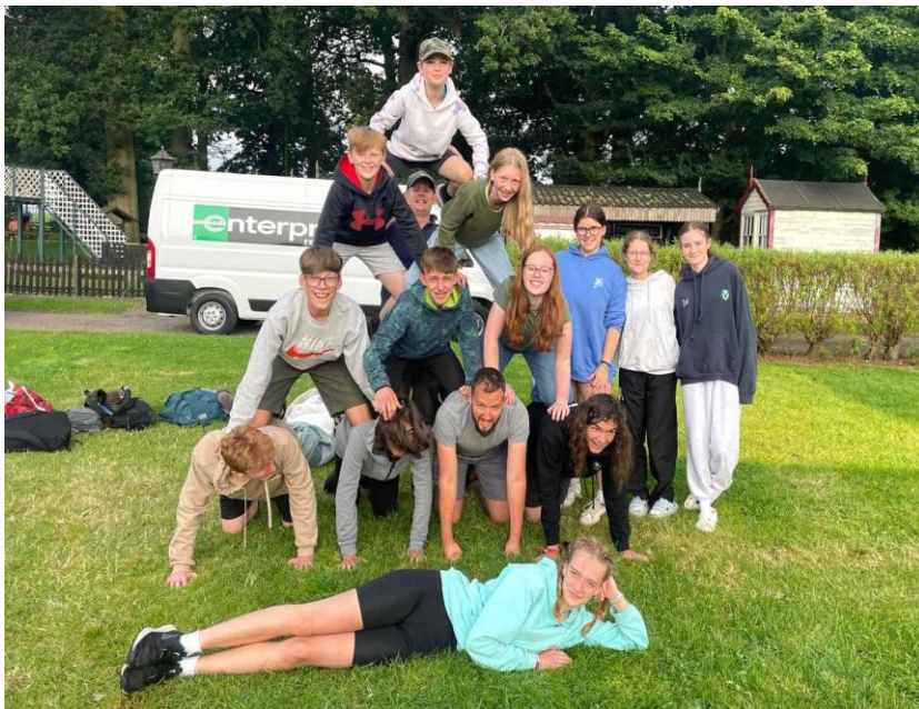
Young people at DTI