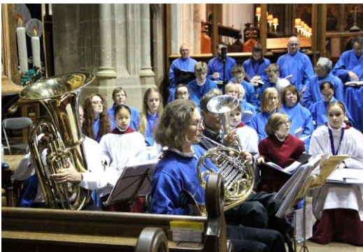
Musicians at an Advent service