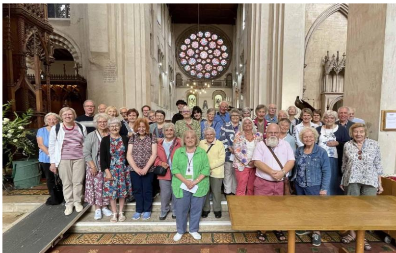
Friends visited two Cathedrals