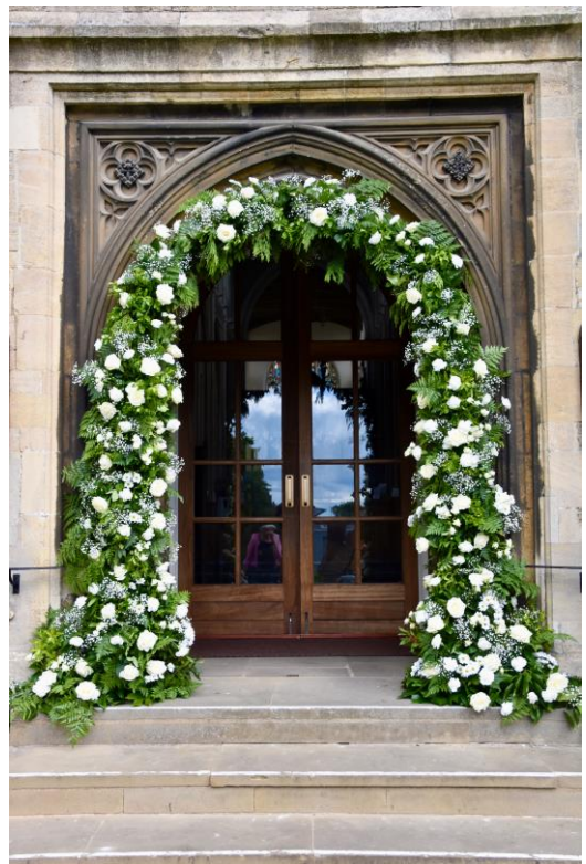
Figure 1 The Arch of flowers for Sam and Becky's Wedding