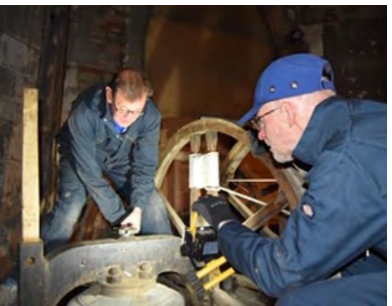
Bell ringers re-installing the clappers