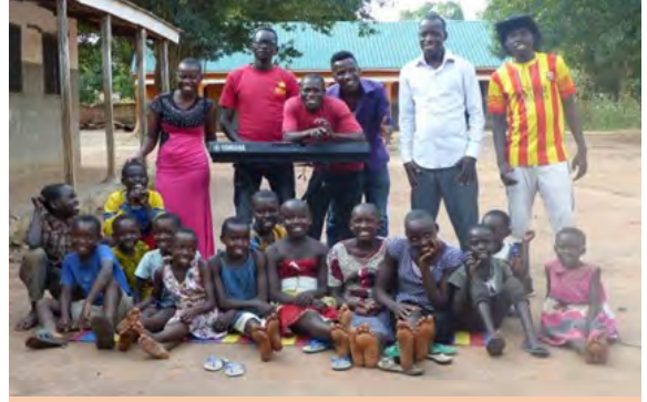
Some of the Youth Group (from Maridi) taking a break from evangelising!

Lynn's inspiration and delight seem to come with the youth in Maridi Diocese now over 200 strong and often leading services that seem to be full of life, energy and joy; she is part of a very active Mothers' Union serving the area with very practical help from providing clothes, food and shelter and just being a wonderful channel of God's Love to those in great need. Her main concern is tackling Nodding Syndrome, which is a neurological condition affecting children between the ages of 5-15 years; it causes